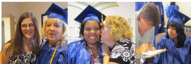
Another successful year! Congratulations to all of our CPI Students and their Families