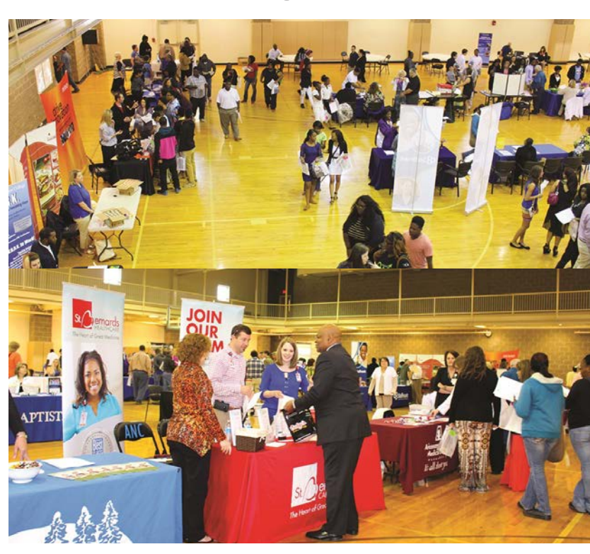
The 2015 ANC Job Fair was held April 23rd at the Briggs/Sebaugh Wellness Center. More than 1,000 participants had the opportunity to speak with area employers and educators. Attendees included approximately 250 high school students from nine area schools.