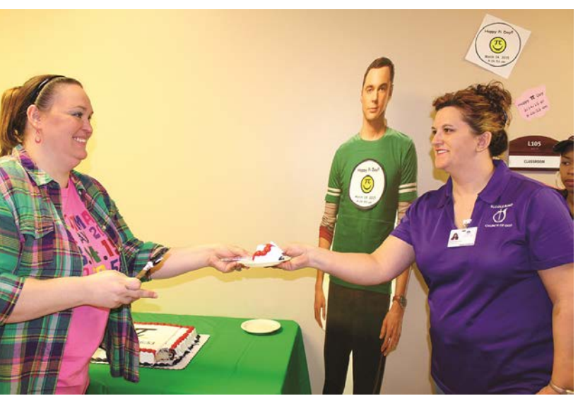
Pi Day is celebrated on March 14th (3/14) around the world. Pi (Greek letter " \pi ") is the symbol used in mathematics to represent a constant - the ratio of the circumference of a circle to its diameter - which is approximately 3.14159. Pi Day was extra special this year, as 2015 stretched the symbolic March 14th celebration out a little longer to 3.1415. Additionally, Pi Day is also Albert Einstein's birthday! In celebration, the ANC Math Department provided tasty snacks for students including cake and pecan pie!