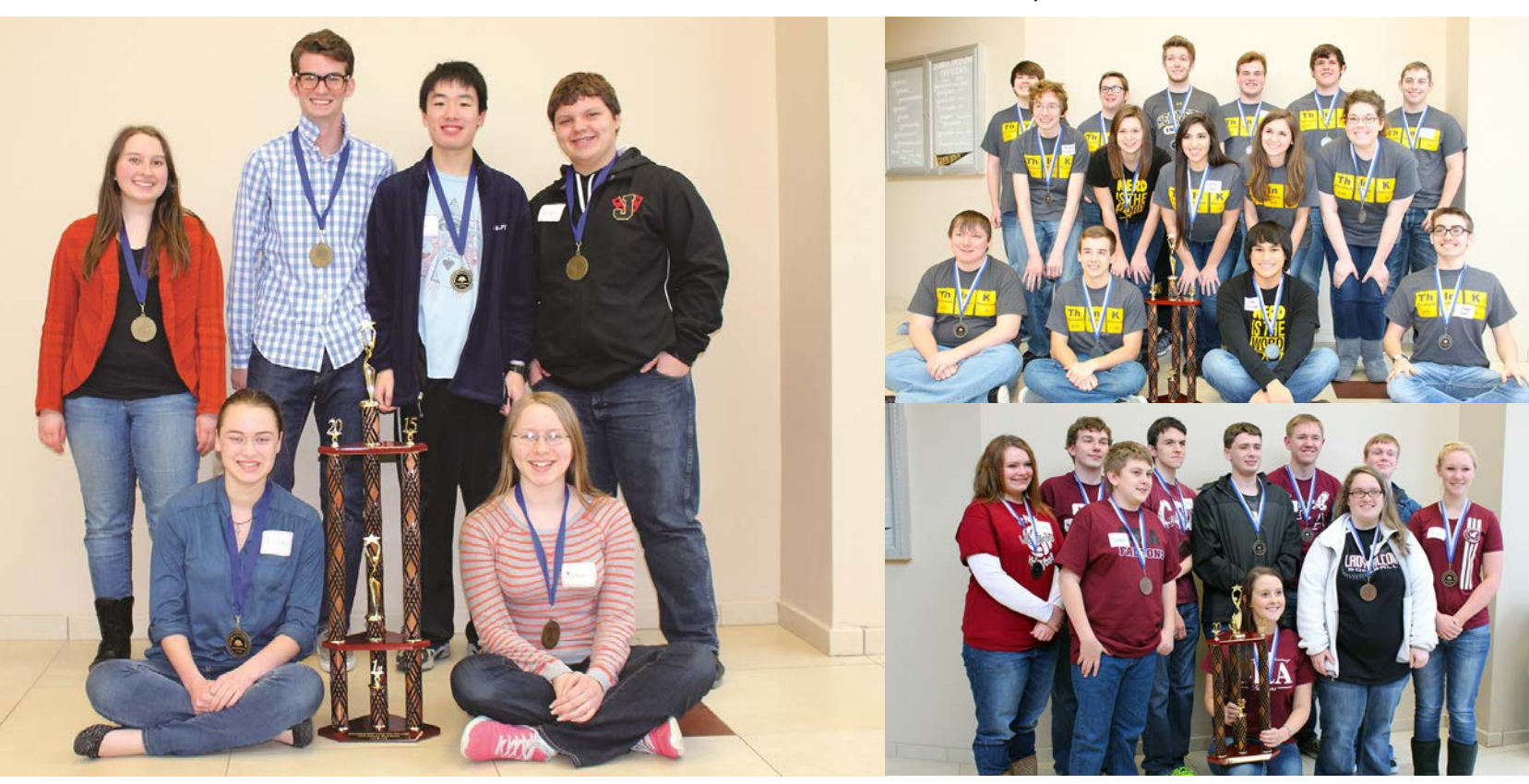
Eleven schools participated in the 10th Annual Quiz Bowl competition held Friday, February 27th on the ANC Main Campus. Quiz Bowl Winner: (LEFT) First Place - Jonesboro High School; (TOP RIGHT) Second Place - Kennett High School; (BOTTOM RIGHT) Third Place - Crowley's Ridge Academy.