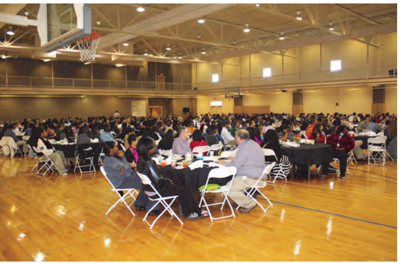
Approximately 380 high school seniors honored at ANC for academic achievements in CTE programs.

On April 5, Arkansas Northeastern College hosted an event called "Graduating to College and Careers" to honor high school seniors who were completers in a career and technical education program of study. There were approximately 380 seniors from Armorel, Bay, Blytheville, Buffalo Island Central, East Poinsett County, Gosnell, Manila, Osceola, and Rivercrest who had the opportunity to hear speakers from various career areas as well as attend workshops on transitioning to college and preparing to enter the workplace. Students were recognized for their academic achievements in the CTE programs during a luncheon held in the Briggs/Sebaugh Wellness Center.