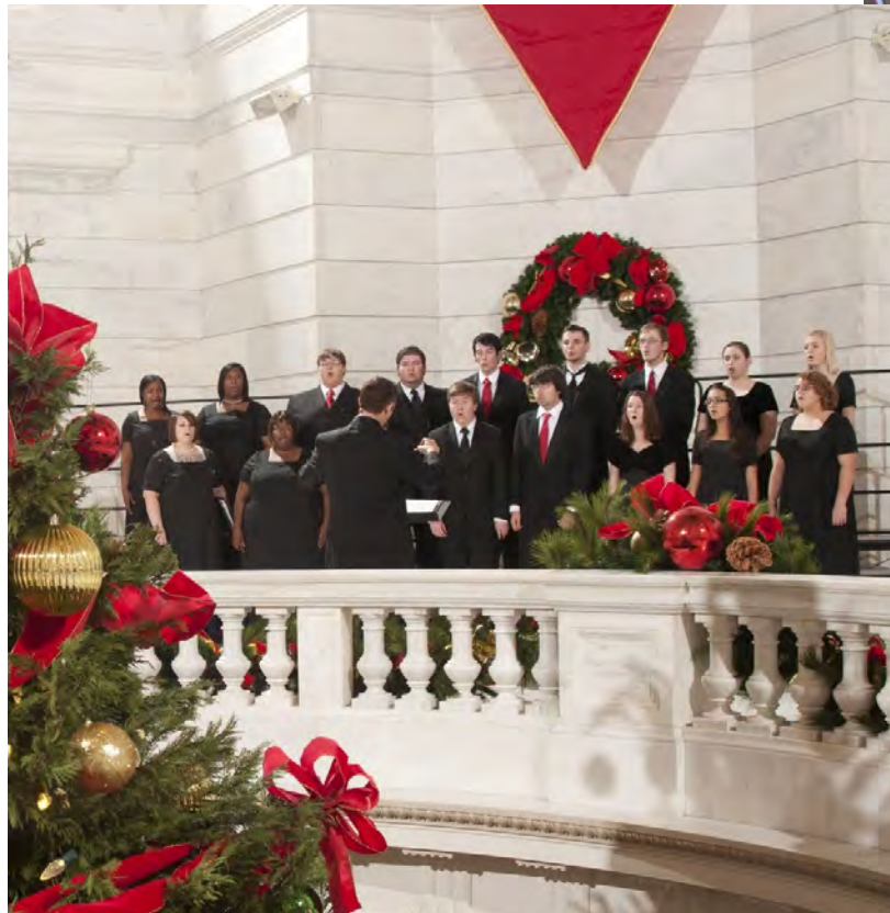
For more pictures, visit www.sos.arkansas.gov

ANC Concert Singers perform at the State Capitol in Little Rock.