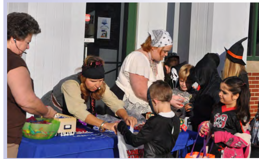
The ANC Leachville center held a Trick-Or-Treat day for BIC East Elementary, where nearly 300 children came by in costumes.