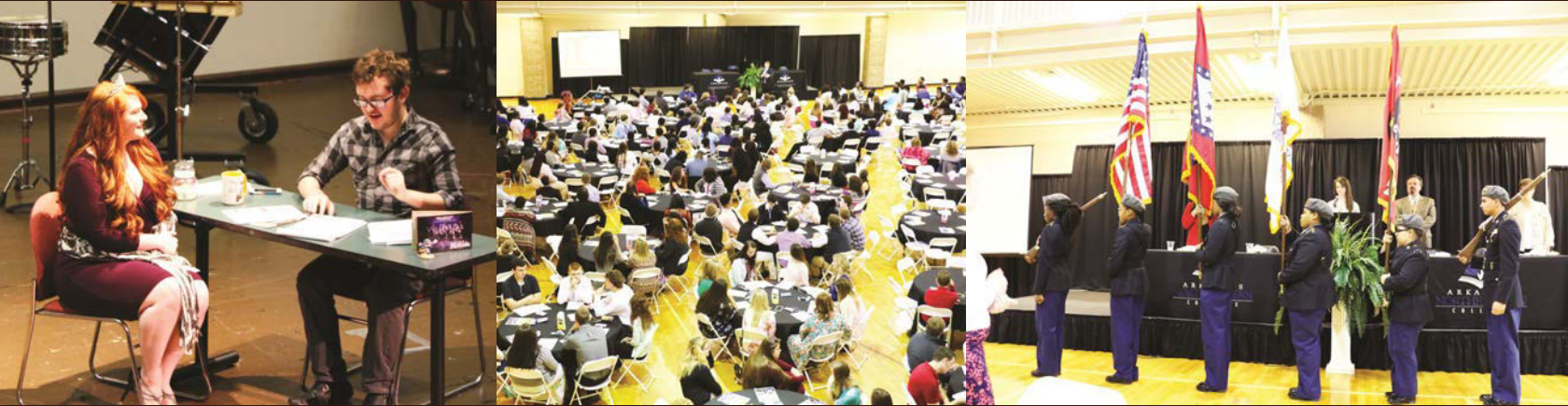
(LEFT) ANC Acting II Class performed skits on “Ways to Blow Your College Interview.” (MIDDLE) Approximately 500 high school seniors were honored for academic achievements in CTE programs. (RIGHT) Presentation of Colors by the Rivercrest High School JROTC.

Participating schools included: Armorel, Blytheville, Buffalo Island Central, East Poinsett County, Gosnell, Manila, Osceola, Paragould, and Rivercrest. Congratulations CTE completers!