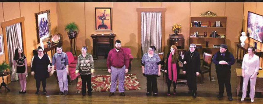
*The Butler Did It* is presented by special arrangement with SAMUEL FRENCH, INC.