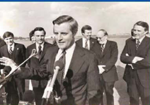
On April 29, 1977, United States Vice President Walter F. Mondale announced that the College had been awarded a $6.3 million federal grant to build the nation's first solar photovoltaic prototype facility in Blytheville, Arkansas.

evolve into the type of institution that focuses on the needs of its local constituency. When the citizens of Mississippi County voted for the establishment of a community college (Mississippi County Community College) which began offering classes in 1975, they did so with