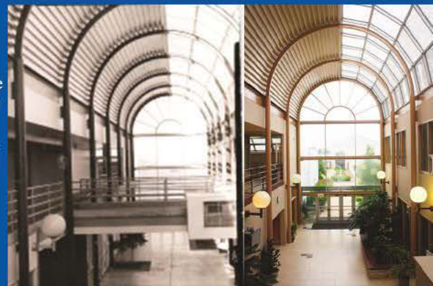
The College building was designed to be energy efficient. The main concourse and two wings were covered with vaulted glass ceilings that could be used for solar shading and were covered with wind-breaking devices.

occupy over 130 acres of land with facilities in five cities across Mississippi and Greene Counties. Still, the philosophy of a local college meeting the needs of its local citizens has not been lost, and Arkansas Northeastern College is proud to have its governing board made up of local people who understand the demands of our rural, Delta region. For many of our residents, Arkansas Northeastern College has provided not only their best hope for education and training beyond high school, but their only hope. We understand our service district, but more importantly, they understand that the Arkansas Northeastern College belongs to them.