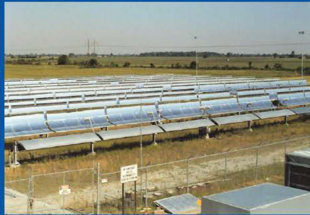
When the College was constructed, The Total Energy Solar Photovoltaic Conversion System was originally intended to power the College by generating both electricity and hot water. A total of 270 single-axis tracking concentrating collectors were installed, each measuring 20'x7'.

The founders of the College have left their thumbprint on Arkansas Northeastern College, and we still value and depend on the collaboration and input from our community. With such community involvement, ANC has garnered private funding for several capital projects such as the Briggs/Sebaugh Wellness Center, the Adams/Vines Library and Recital Hall, the Angela Wren Nursing and Allied Health Center, the Harry L. Crisp Center, the ANC Osceola Center, the ANC Leachville Center, and numerous donations toward the future Center for Allied Technologies. While we marvel at our 40 years of past success, we do so with excitement and readiness for the future.