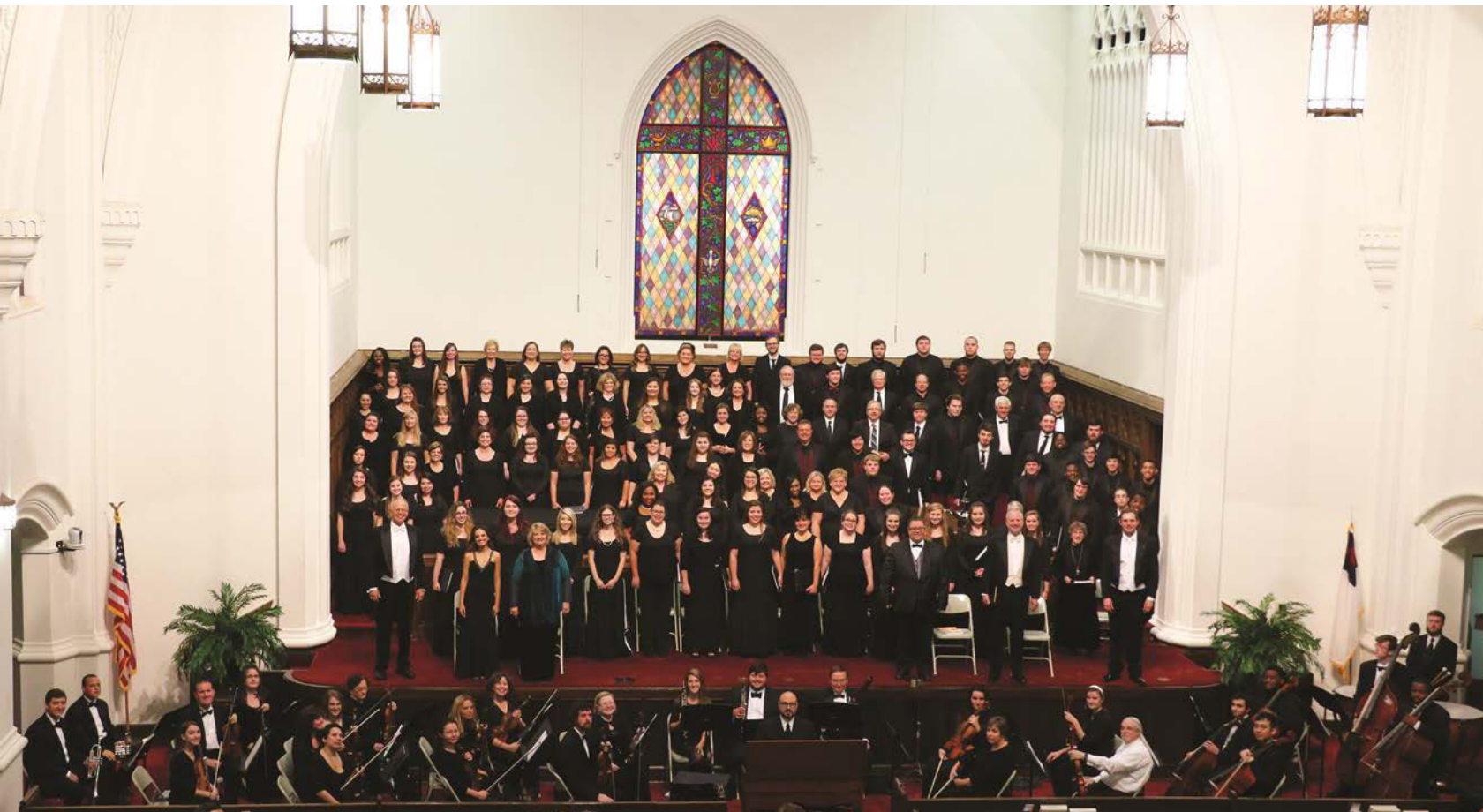
The ANC Concert Singers, Chamber Chorale, Treble Chorale, Community Choir, and Community Chamber Choir and Arkansas State University's A-State Concert Choir, and University-Community Singers along with the Gosnell High School Chorus and University of Memphis Orchestra members joined their talents for the G.F. Handel's 'Messiah' concerts. Concerts were held November 8th at First Baptist Church Blytheville, AR and November 9th at the A-State Fowler Center in Jonesboro, AR.