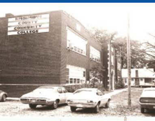
Classes began in the former Sudbury Elementary School on South Lake Street. Approximately 800 students enrolled for credit the first term.

From its creation, your College has been one attuned to innovativeness, and that trait has become our tradition. When in 1976, the Department of Energy and the Solar Energy Research Institute were allotted funds for a Total Energy Solar Photovoltaic Conversion System that would be the largest of its kind in the world, Mississippi County Community College was chosen for the project. With the United States facing an energy crisis in the mid-1970s, a comprehensive energy plan that included the research and development of solar energy was created—and your college was a part of that planning. The Total Energy Solar Photovoltaic Conversion System was originally intended to power the College by generating both electricity and hot water. The project provided both an important experimental tool, as well as a campus for the new college campus in 1980.